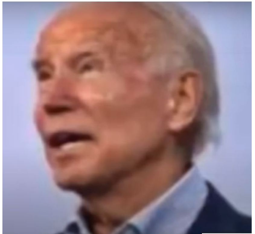
left: blue contactlenses of red-eyed Biden shifted a bit up